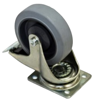
Swivel Caster with brake