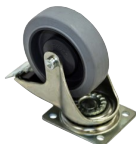
Swivel Caster with brake