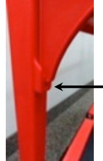
STABILIZER BAR NOT SEATED PROPERLY

Note: To install shelves, start with the bottom shelf and work your way up (#1-#5)