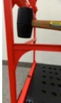
HAMMER STABILIZER BARS DOWN