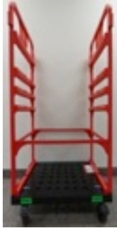
BOTTOM STABILIZER BARS

Step 4 – Insert bottom stabilizer bars into the slots on side panels, using rubber mallet. Make sure stabilizer bars are seated properly. (See pictures.)