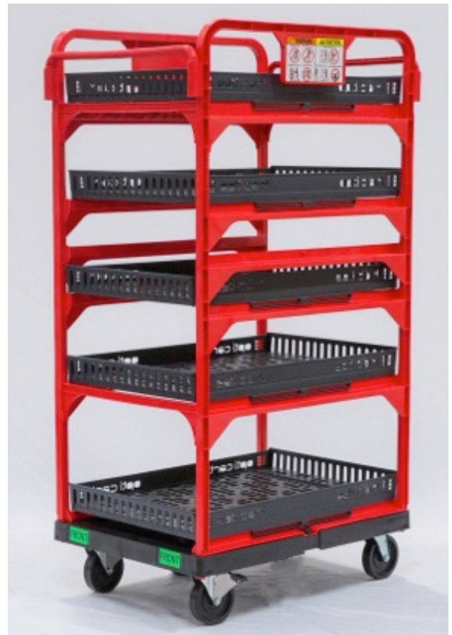
Fully assembled Cart

If you have any questions, please call customer service at 1-855-333-4943 or email at: info@effizientllc.com